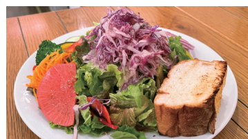
サラダレストラン Mr.&Mrs.GREEN Salad Restaurant Mr.&Mrs.GREEN

☎ (092) 733-7272 📍 7F, 2-2-43 Tenjin, Chuo-ku, Fukuoka City 🕒 [Lunch] 11:00–16:00 (L.O 15:00) [Dinner] 17:00–22:00 (L.O 21:00) 🚪 CLOSE Follows the building's schedule