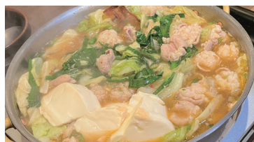
もつ鍋 極味や 赤坂店 Motsunabe Kiwamiya - Akasaka

☎ (092) 761-2929 📍 1F, 1-6-22 Akasaka, Chuo-ku, Fukuoka City 🕒 Weekdays 18:00–23:00 (L.O 22:30), Sat / Sun / Holidays 17:00–23:00 (L.O 22:30) 🚪 CLOSE Irregular holidays