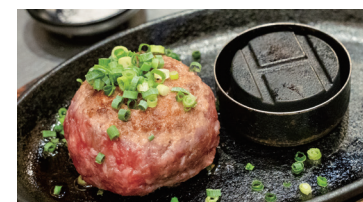
ハンバーグ 極味や 福岡/パルコ店 Kiwamiya - Fukuoka Parco

☎ (092) 235-7124 📍 B1F, 2-11-1 Tenjin, Chuo-ku, Fukuoka City 🕒 11:00–22:00 (Last entry around 20:30) 🚪 CLOSE Jan 1 / Follows the building's schedule