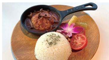
and S organic and S organic

☎ (092) 522-6767 📍 1F, 3-3-5 Yakuin, Chuo-ku, Fukuoka City 🕒 [Morning] Mon-Wed / Fri 8:30–11:00 [Lunch] 10:00–17:00 [Dinner] 17:00–22:30 🚪 CLOSE Thu