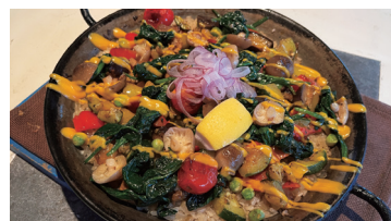
レストラン サンチョパンサ Restaurante SANCHO PANZA

☎ (092) 762-4110 📍 5F, 1-15-11 Daimyo, Chuo-ku, Fukuoka City 🕒 [Lunch] Sat / Sun / Holidays 11:30–15:15 [Cafe] Sat / Sun / Holidays 15:15–18:00 [Dinner] 18:00–23:00 🚪 CLOSE Irregular holidays