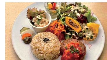
ロタカフェ フクオカ RotaCafe Fukuoka

☎ (092) 738-1414 📍 1F, 1-3-25 Hirao, Chuo-ku, Fukuoka City 🕒 11:00 – 18:00 🚪 CLOSE Sun / Holidays