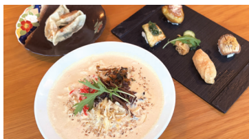
Vegan Ramen YADOKARI Vegan Ramen YADOKARI

☎ (0940) 35-2900 📍 2F, 3-22-3 Hirao, Chuo-ku, Fukuoka City 🕒 10:00 – 15:00 (L.O 14:30) 🚪 CLOSE Sun